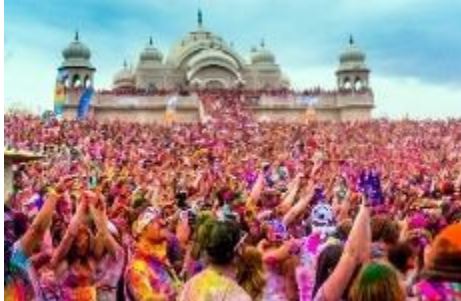
This Photo by Unknown Author is licensed