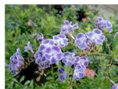
Duranta. Geisha Girl